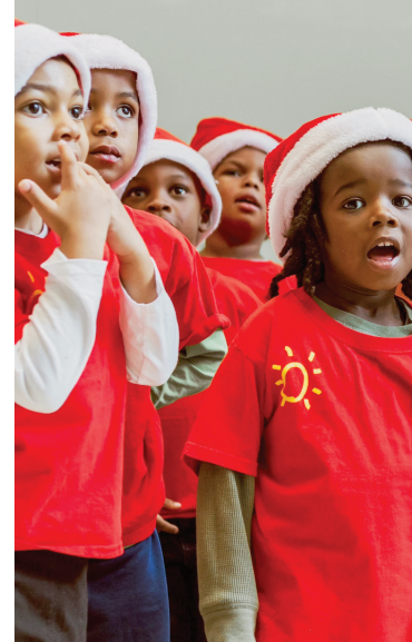
Carolers from Operation Breakthrough