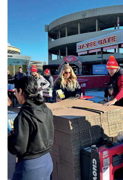
Chiefs Kingdom Food Drive for Harvesters

Olathe Public Schools Foundation Operation Breakthrough Pat Mahomes Benefit Golf Tournament Phoenix Family Principal's Connect ProX Red Tail Academy Rockhurst University Ronald McDonald House Charities of Greater Kansas City Rose Brooks Saint Lukes Health System Seven Days Make a Ripple Sheffield Place Systems of Care Initiative St. Michael the Archangel