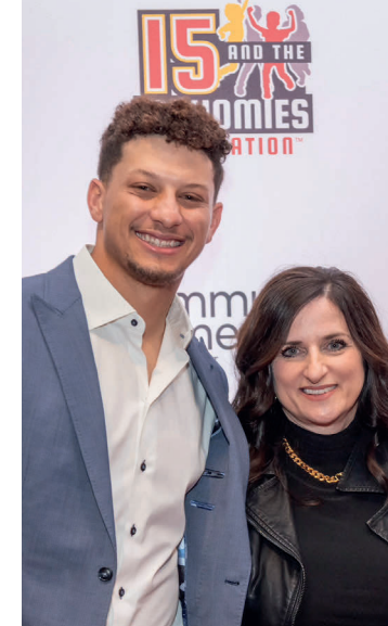
15 and the Mahomies Foundation Annual Gala