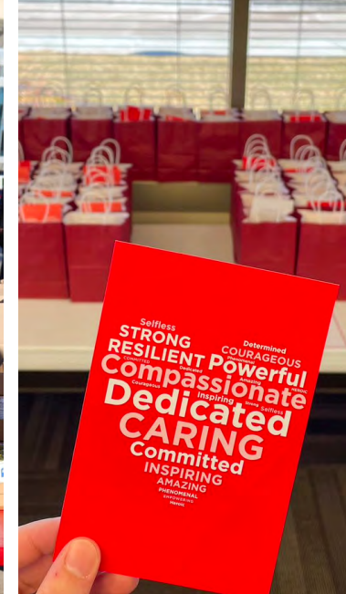
Children's Mercy Valentines Bags for Urgent Care Staff