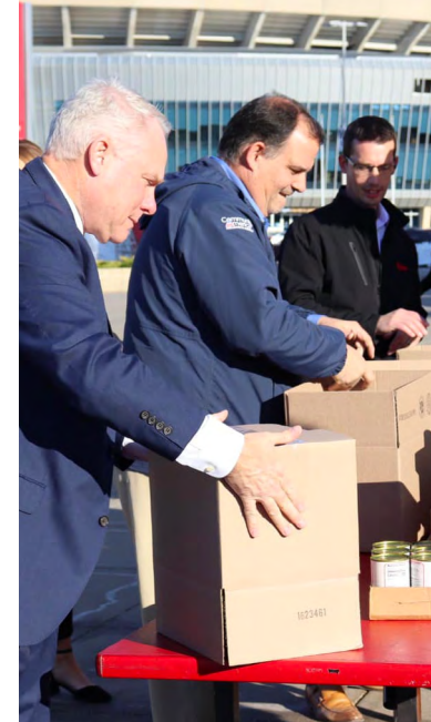
Chiefs Kingdom Food Drive for Harvesters