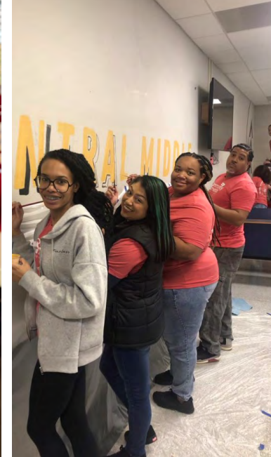
City Year MLK Day of Service